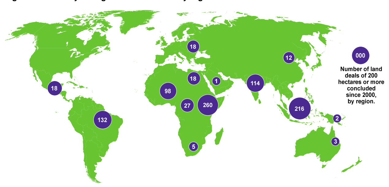
Figure 3: Summary of large-scale land deals by region since 2000

Today, the controversial leasing and selling of land is alive and well, and increasing. Increasing since 2000, more than 900 large-scale land deals have been recorded (see Figure 3), the vast majority of which took place in 32 countries with 'alarming' or 'serious' levels of hunger. More than 60 percent of foreign land investors intend to export everything they produce, and in many cases, what is grown will be processed not into food but fuel. To make matters worse, land acquired between 2000 and 2010 in these deals could have produced enough food for 1 billion people.