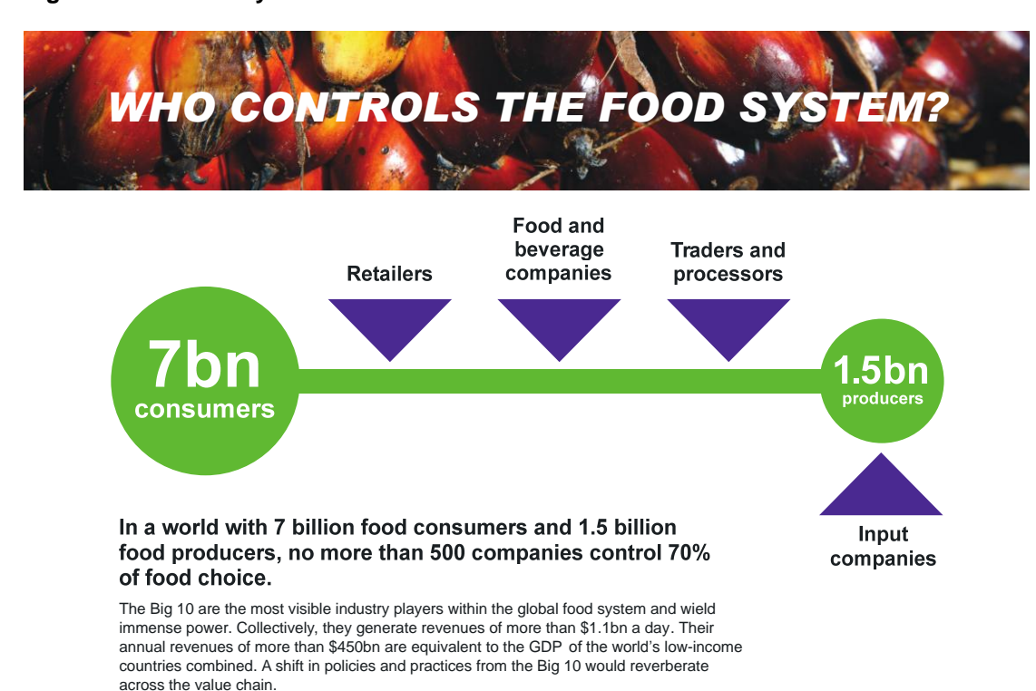
Figure 1: The food system

But unlike the manufacture of branded sneakers or the creation of new electronic gadgets, what is grown, where, and how it is distributed affects every human being on earth.