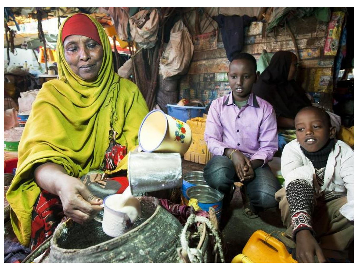
A woman trader in Hargeisa market serves a cup of fresh camel's milk. Small-scale business women often rely on remittances as start-up money for their stalls.