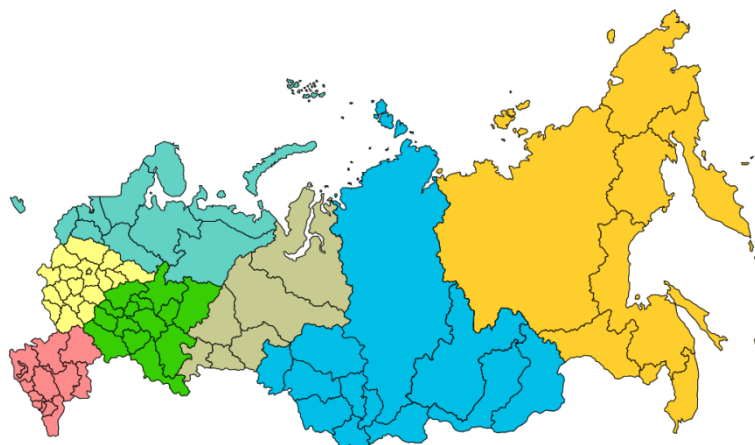
Figure 3: Gross Production of Grain by Region (Million Tons)