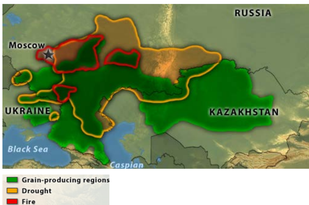
Figure 5: Map of Russia highlighting the overlap of grain producing regions, drought and wild-fires

Ref: Goodrich, L (10 August 2010) Drought Fire and Grain in Russia , Stratfor